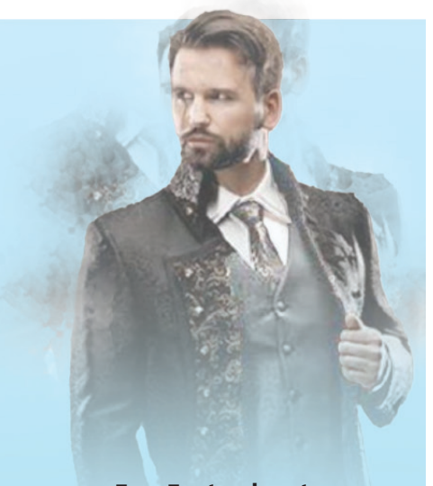
Fun Facts about Much Ado About Nothing