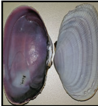
Asaphis deflorata , Bailey-Matthews Shell Museum.