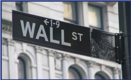
Wall Street Sign by Ramy Majouji, Wikimedia Commons.