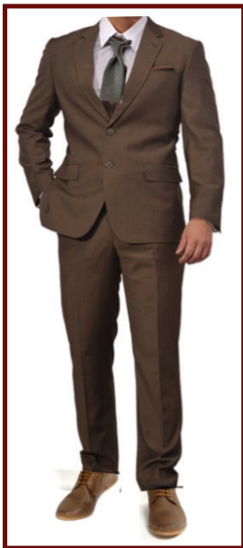
Luke

27. Refer to your research on the Lenape tribe and matrilineal-based society. How does the breakdown of power within the Lenape tribe differ from the breakdown of power for the Dutch? How does this power conflict contribute to the events of the play? Who are the women that carry the play forward and why? Who makes the rules in the play and how do they use their power?