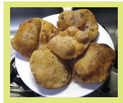
Frybread

33. In reference to the Lenape making frybread when the government only gave them flour and lard, Debra says “But it [frybread] represents what’s best about your people. Our resilience. No matter how much they take away from us, we always make something out of nothing.” What events in the play have forced the Native characters to be resilient?