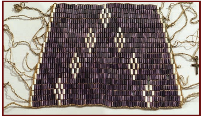
Wampum Wrist Ornament, Native American Collection, Peabody Museum.

4. Research Pearl Street in New York City. Why was this area significant for the Lenape? What is wampum, and what importance does it have in Natives' lives? These and other websites provide information: http://www.ourtimepress.com/lenapes-griot-voices-christopher-paul-moore-speaks/ http://www.nativetech.org/wampum/wamphist.htm http://ganondagan.org/Learning/Wampum