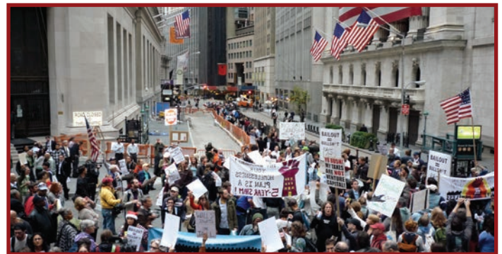
Wall Street Protest 9/25/2008 by Teri Tynes, Flickr.

7. Research the 2008 financial crisis. What corporations were the biggest influence in the collapse and how did their role affect the U.S. economy? These and other websites provide information: https://www.thebalance.com/2008-financial-crisis-3305679 https://www.huffingtonpost.com/james-randel/understanding-the-economy_b_520283.html