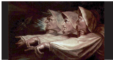
The Weird Sisters by Johann Heinrich Füssli.