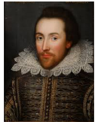
The Cobbe portrait of William Shakespeare.