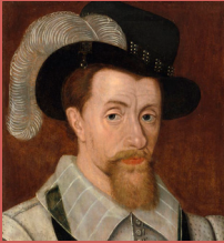
James IV of Scotland, I of England and Ireland.