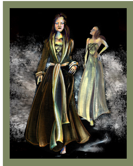
2019 costume rendering for Lady Macbeth by Chrisi Karvonides-Dushenko.

http://www.carmentablog.com/2016/02/23/xenia-laws-of-hospitality-in-different-cultures/